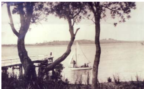
Sailing across Anderson Inlet and landing at Point Smyth in 1926.

You are invited to participate in the Regatta's sailing, boat displays and social program which provides for people to get together, meet old friends and make new acquaintances. The 2017 Regatta is envisaged to be an outstanding regatta for the participants, whether sailing their wooden dinghies or displaying them for all to see. Participants will be provided with the opportunity to enjoy a social sail up the inlet and also test their skills in the Regatta race which is dedicated to classic wooden dinghies. There will be displays of classic wooden dinghies for the public and awards will be provided to most worthy winners of the various categories.