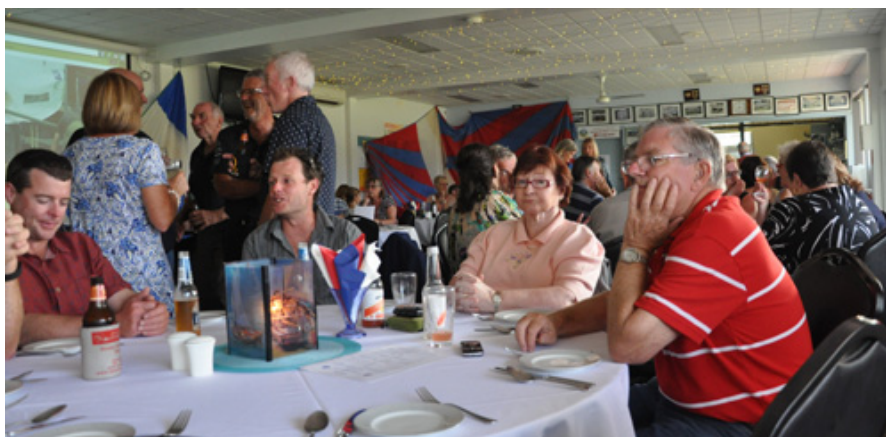
The Regatta dinner was held at the Inverloch Bowling Club